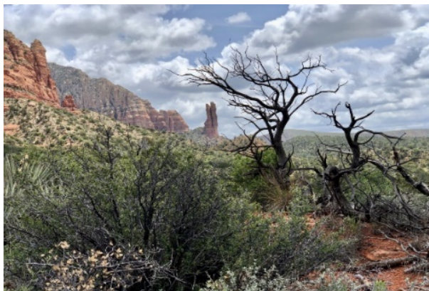
Desert photo courtesy of Jessie Lacy '65

Schedule at your convenience online at www.dothecanyon.com or 1-800-514-0884.