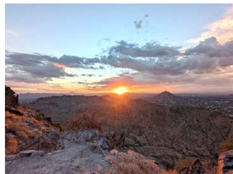
Piestawa Peak