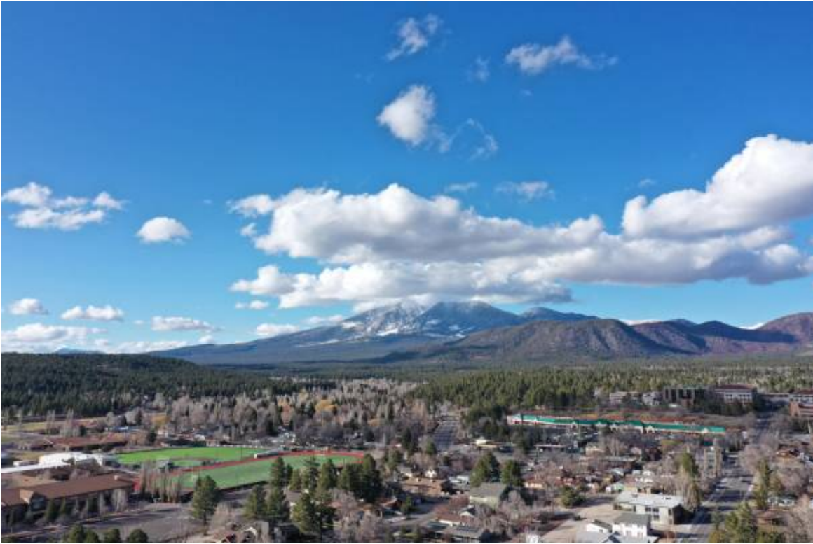
Flagstaff and Flagstaff Mountain

So much to see in Arizona so take a look at the Flagstaff Visitors Guide by clicking here .